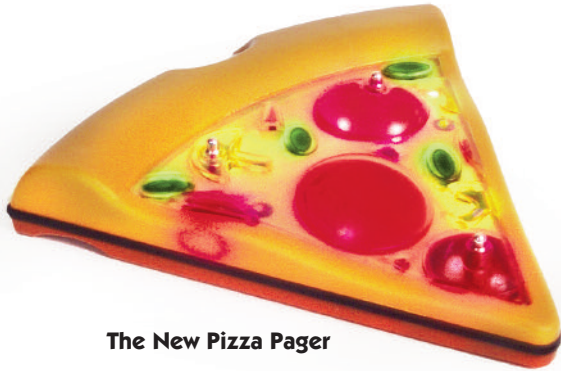
The New Pizza Pager